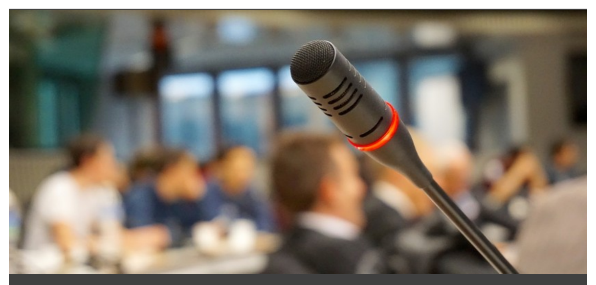
Save the dates!

Duplication Checker (Issues2) which helps you find duplicate records in your repository is now being used by a number of early adopters. The latest version of this plugin can be found on the <u>EPrints Bazaar</u>.