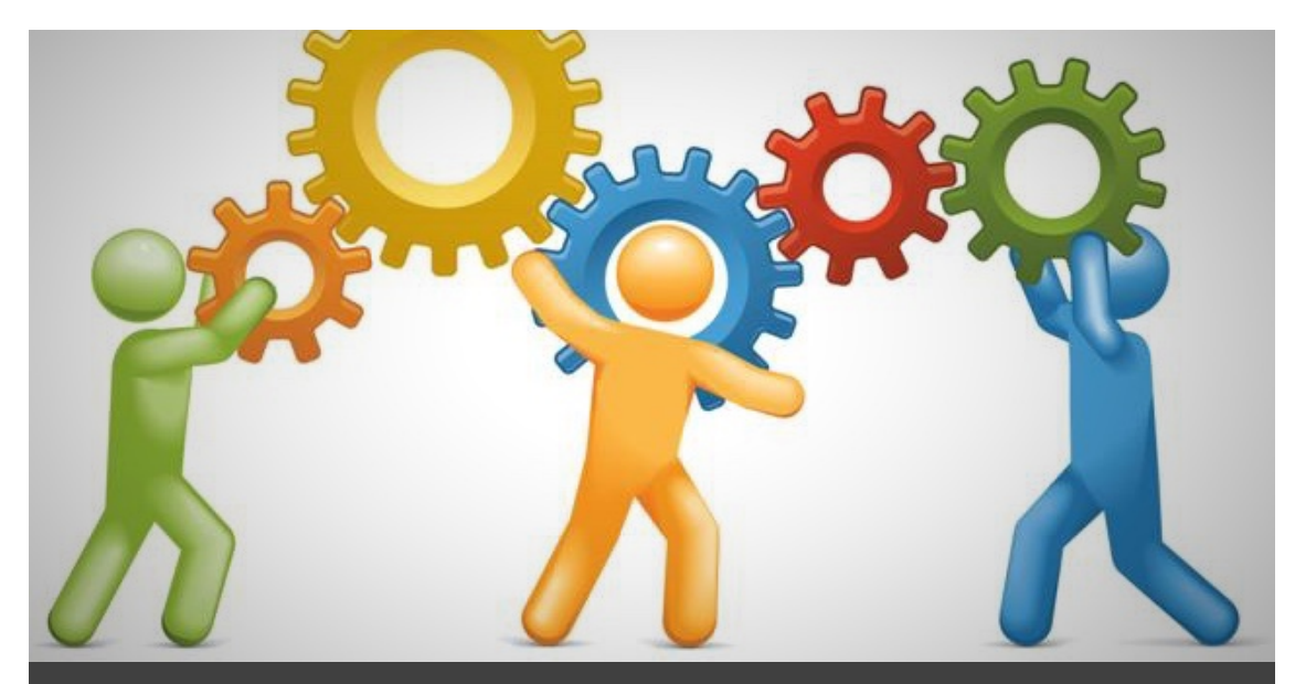
Jisc work update

If you are interested in what the REF Support Package can do for you, please get in touch.