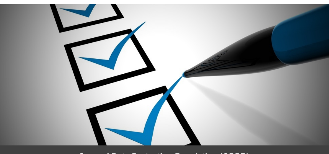
General Data Protection Regulation (GDPR)

We look forward to sharing more details on these extensions in our upcoming newsletters.