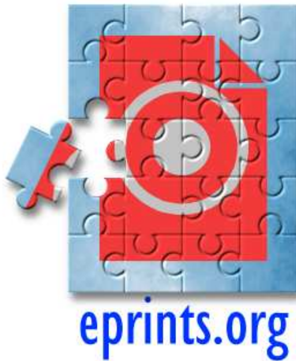
Figure 16.1: EPrints Logo