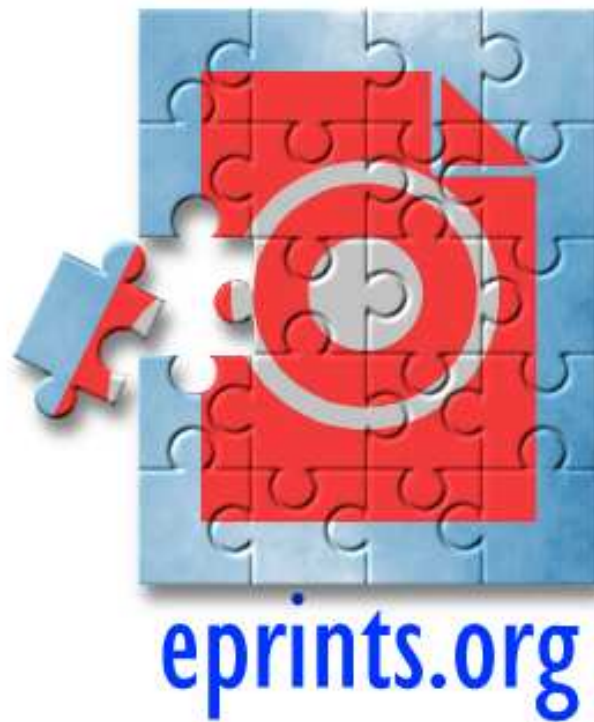
Figure 16.1: EPrints Logo